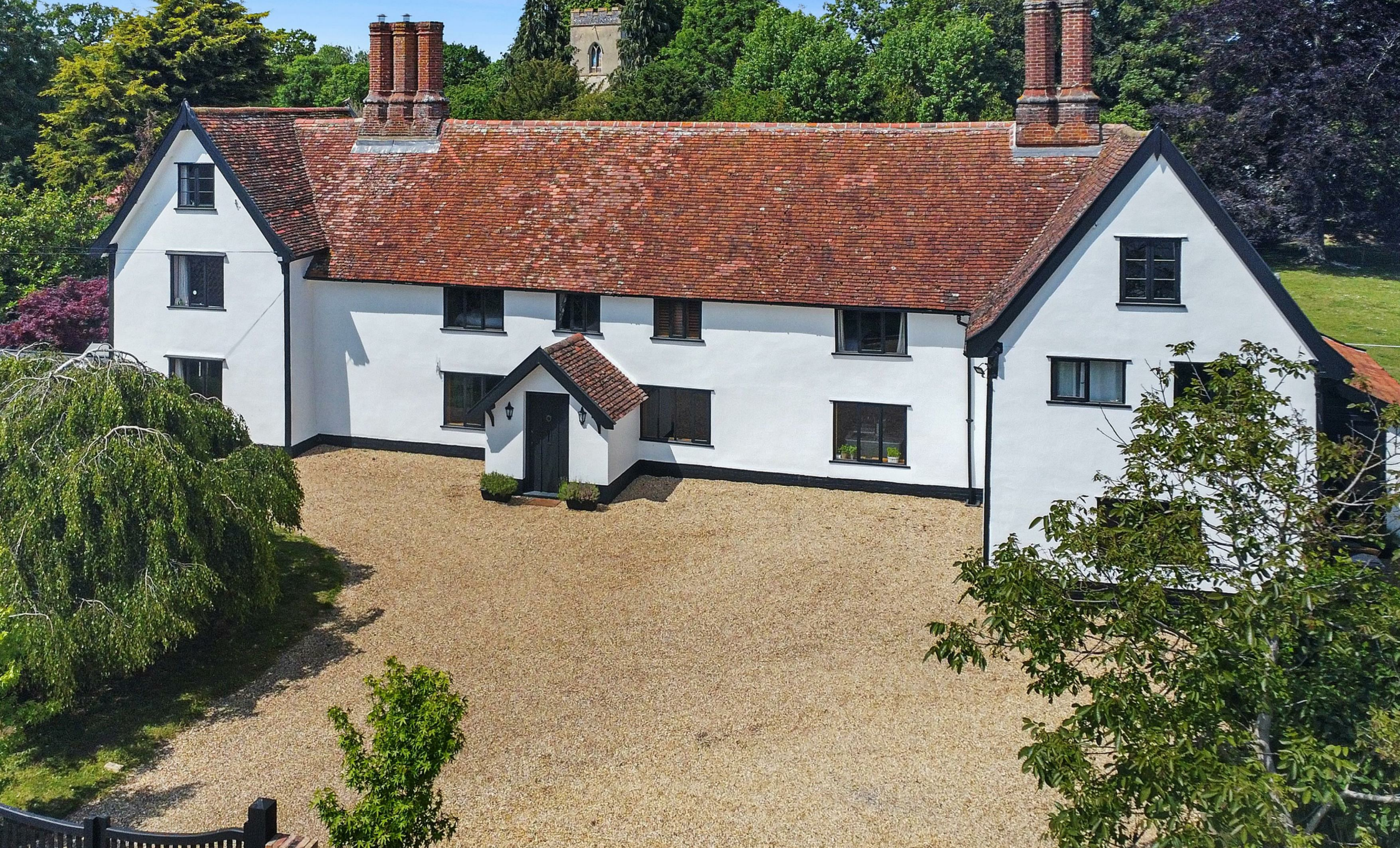
Green Hall, Finningham